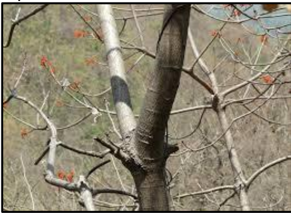
Fig. Udal Tree